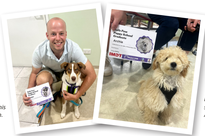
One proud owner with his pooch, Ralph.